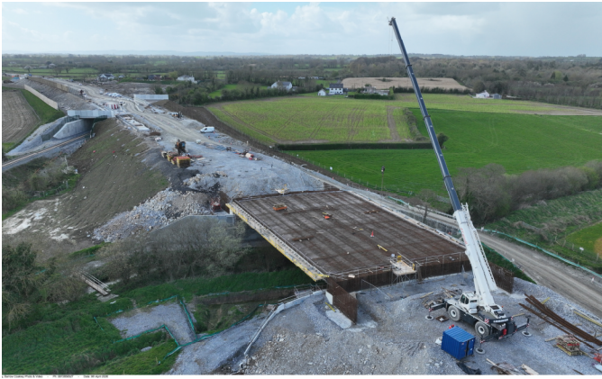
RVB02 River Bridge Construction