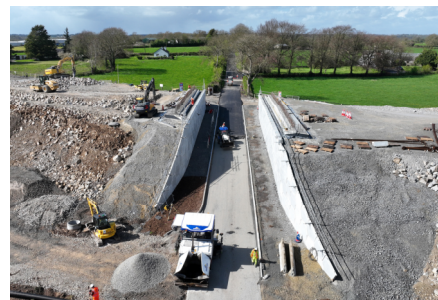
Side Road L1422