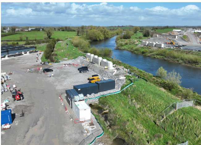
West Side River Maigne Bridge