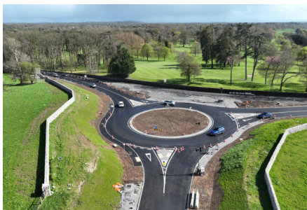
N21 Roundabout Adare