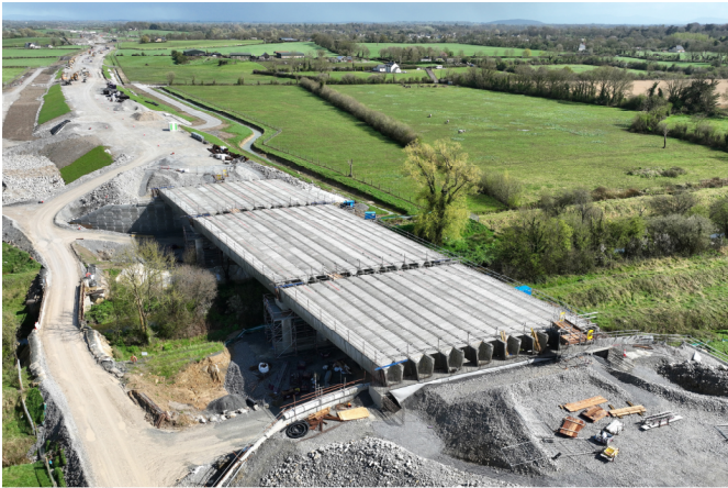
RVB03 River Bridge Construction