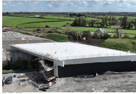
River Bridge M21-C3