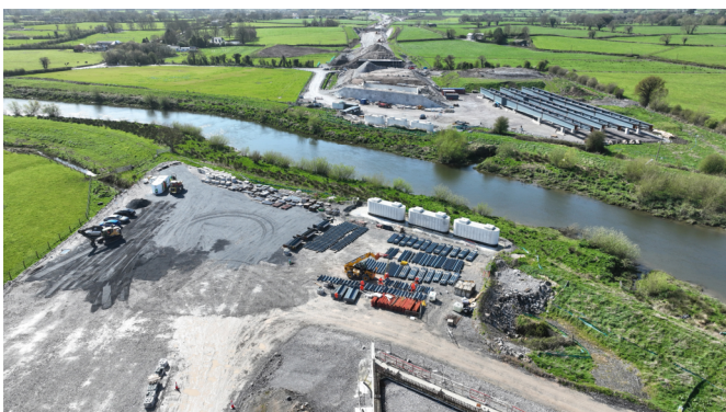
East Side River Maigne Bridge